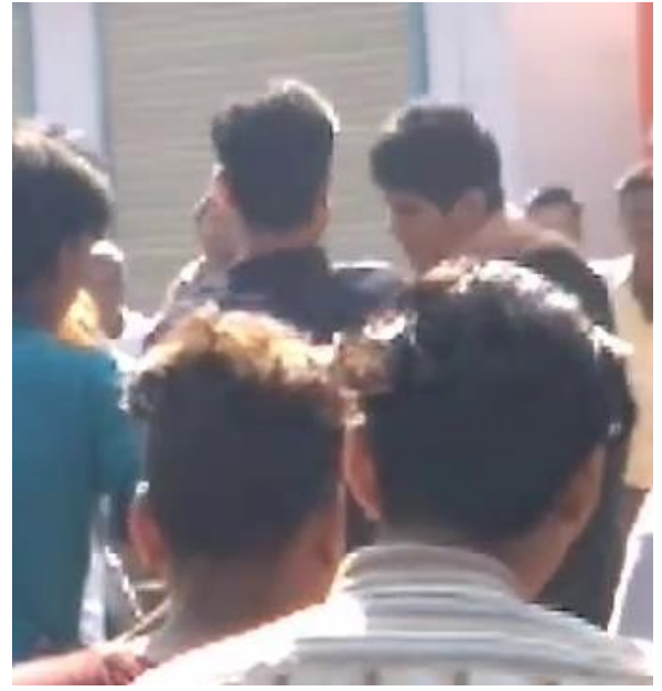
he was made to bow to their feet in the same video